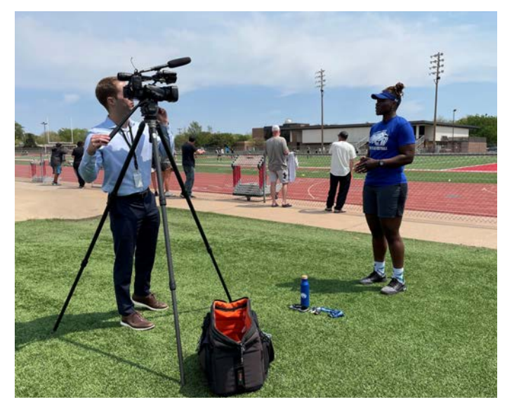
KWCH 12 Newstalk Feature