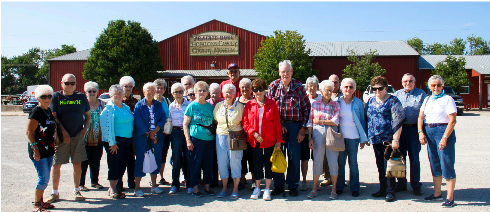
Prairie Rose Chuckwagon, Benton KS. 7/18/15

Area senior citizens over the age of 62 are invited to participate in Club 62 programming and events. There is no cost for Club 62 membership, and nominal fees are charged for event participation. Summer 2015 programs have now concluded and will resume in Fall 2015. For more information, visit prattcc.edu/club62