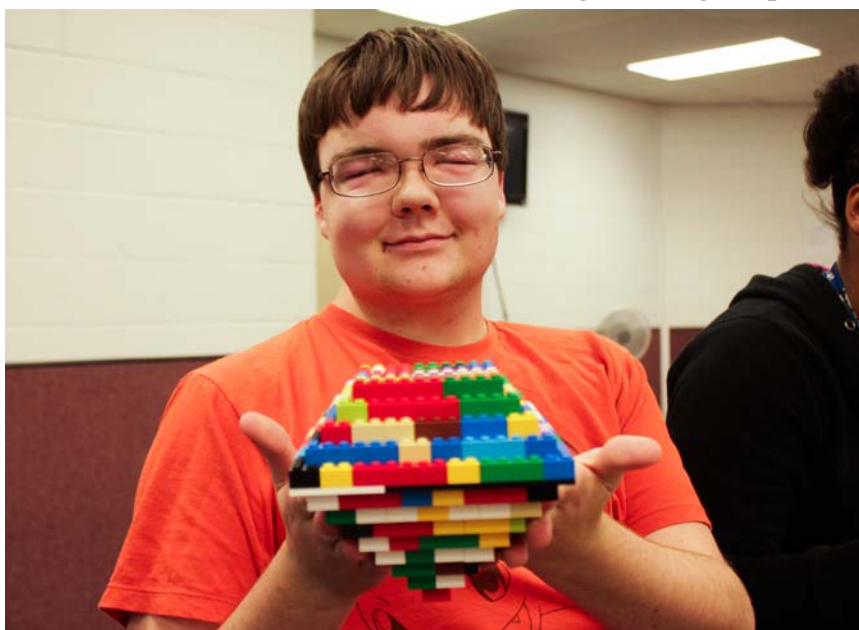
Student Life holds Lego building competition