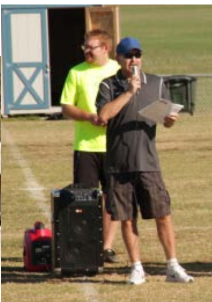
Family and friends of men's and women's soccer celebrate the team sophomores on Oct. 25