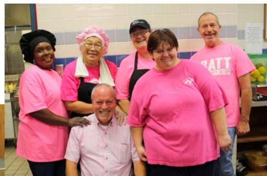
Below: Volleyball sells pink-out t-shirts