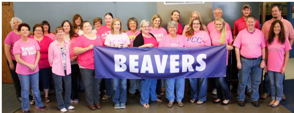
Above: PCC employees go pink