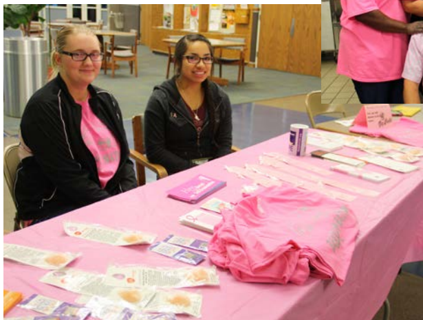
Below: PCC Volleyball holds "Dig Pink" match on Oct. 28. This Side-Out Foundation event is held at schools nationwide. All proceeds benefit medical research organizations and entities that provide support to breast cancer patients and their families.