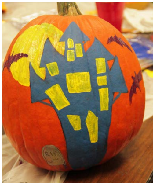
Students decorate pumpkins in carving and painting contest