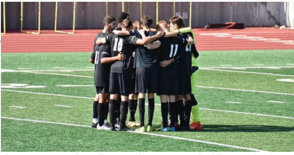
The Pratt Community College men's soccer team huddles together in their final game of the 2018 season.

A bad start plagued the Beavers, but PCC managed to keep even in the second half. The blue and white