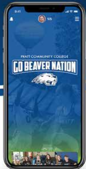
3 Enjoy your fan experience, including events, rewards, and more.