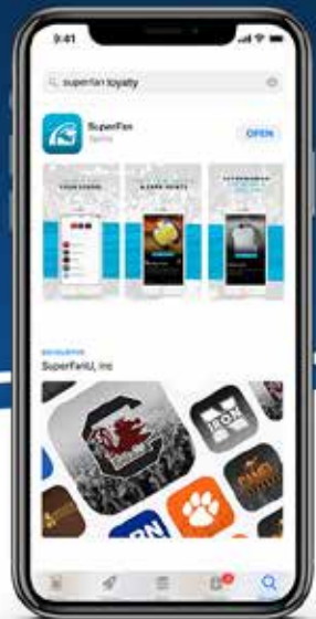
1 Download the SuperFan app for iPhone or Android.

For PCC Away Games Visit!!! WWW.GOBEAVERSPORTS.COM