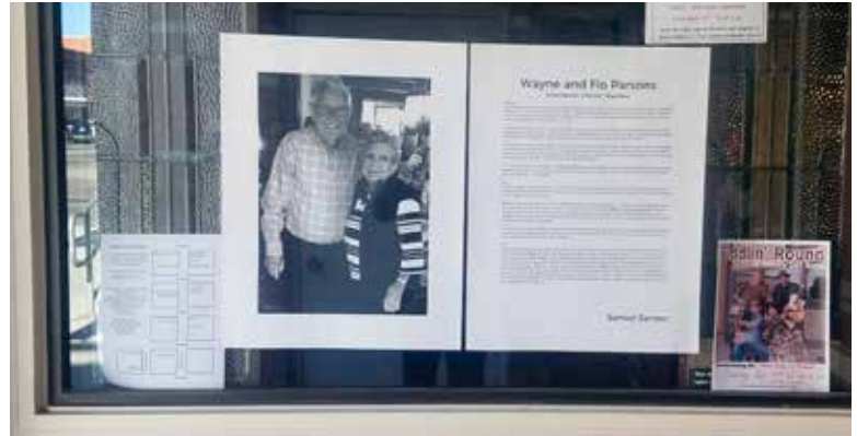
provide the students a quick photography course to help the amateur photographers hone in on their photography skills.

Along with interviewing the senior citizens, students were required to take their photograph. Local photographer, Stan Reimer, was able to