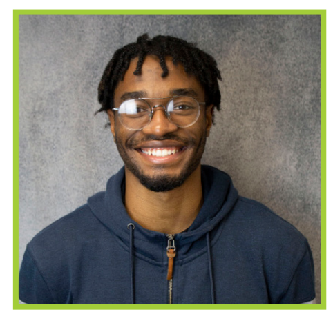
"It's not hard to say thank you. We forget to say thank you to people that's helped us in the past and you know, show that we're grateful."