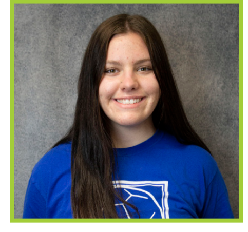
"Something I've learned is if you put yourself out there more people are willing to like talk to you so if you approach them they're actually willing to open up and hear what you have to say if you go to them and open up to them first."