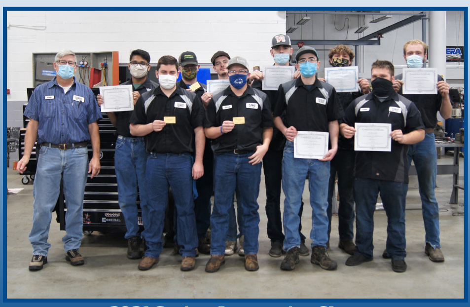
2021 Spring Automotive Class