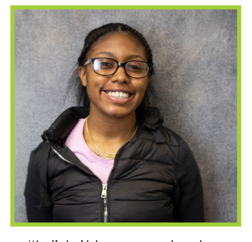
"I didn't know we had so many sponsors. I was really shocked when I saw the list I was like oh, oh that's basically the whole city of Pratt. It made me more thankful and appreciative."