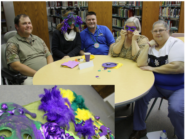
Students and employees gather in the PCC library to celebrate Mardi Gras on Feb. 17

On Feb. 9 we welcomed the board members and administration from USD 382 to campus for a dinner and discussion. We are thankful for opportunities to partner with the fantastic school districts in our area.