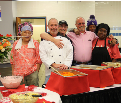
Great Western Dining Staff put together a festive feast for Valentine's Day.