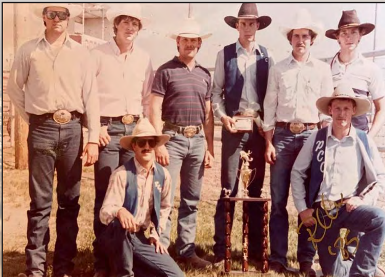
1985 PCC Rodeo Team at GCCC Rodeo