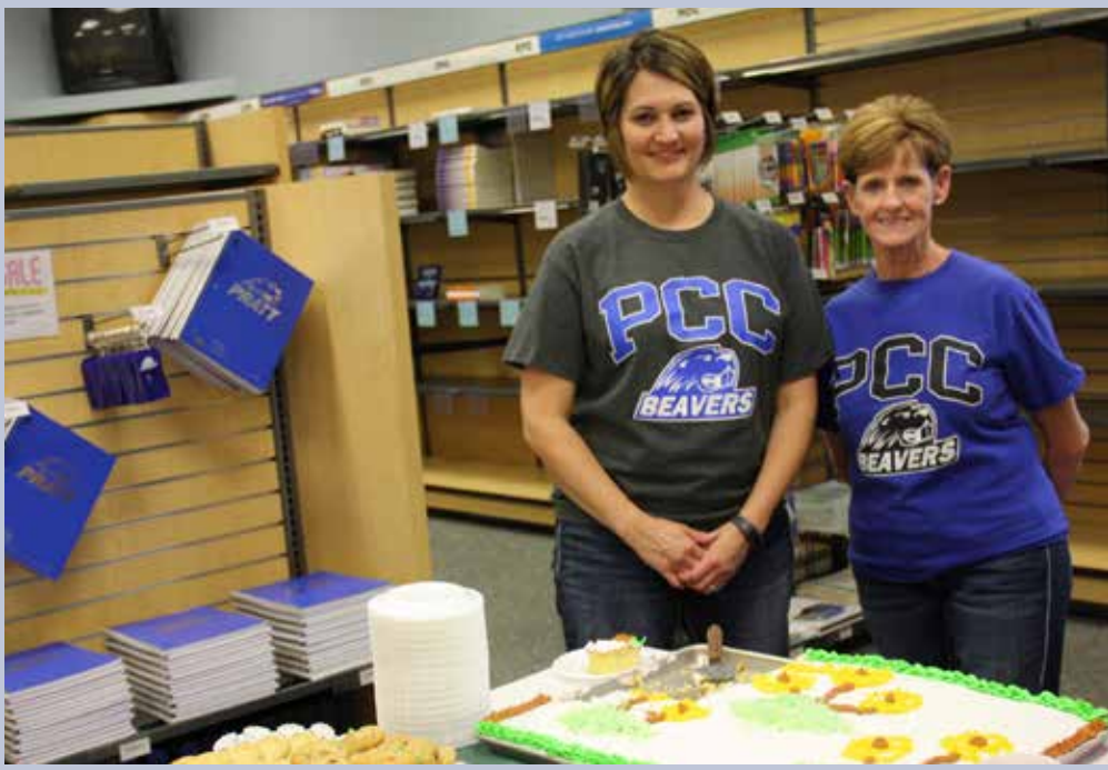
April 22 - The bookstore hosts a cake and punch party celebrating administrative professionals and Earth Day.