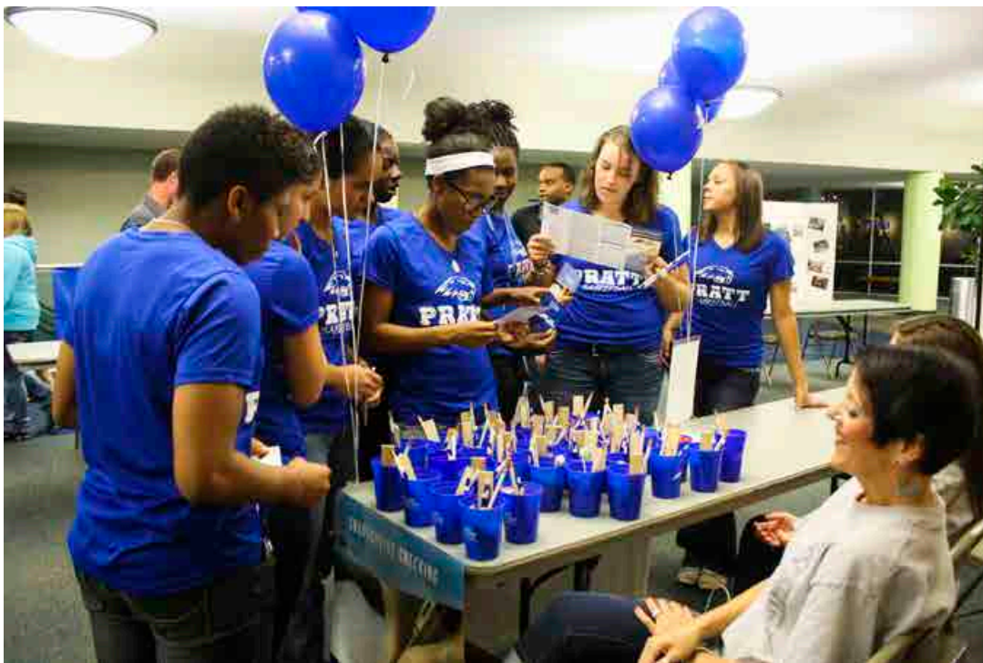
PCC students interact with First State Bank at "Meet Pratt Night" in August 2013